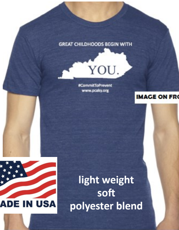
IMAGE ON FRONT.