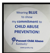
Wear Blue Day Lapel Stickers