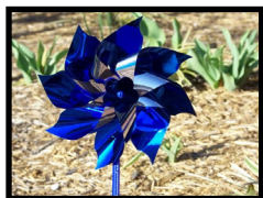
Blue and Silver Pinwheels

Visit the PCAK Online Store to purchase promotional items such as blue and silver pinwheels, yard signs, lapel pins, and more.